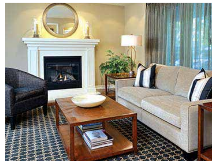
BOTTOM LEFT: ASCOT CARPET BY STANTON CARPET; AVAILABLE THROUGH DESIGNERS ACROSS CANADA

the rug should be large enough to slide under the front legs of sofas and chairs in a seating arrangement